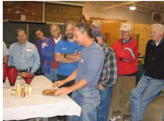
Alan Russo-Segmented platter