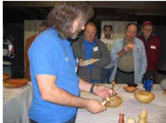
Martin Rost-Small poplar and dogwood vessels & mushroom