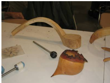
Joe Savarese -hand carved figured pumpkin of basswood-painted and glazed