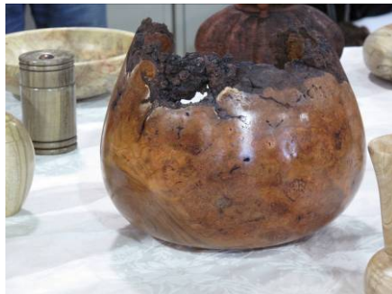
Ken Deaner- maple bowl, small lidded chestnut box, colored, carved, textured maple teapot