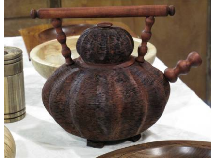
LIWA Tuesday Morning Group- lidded box and curved platter donated to BOCES.